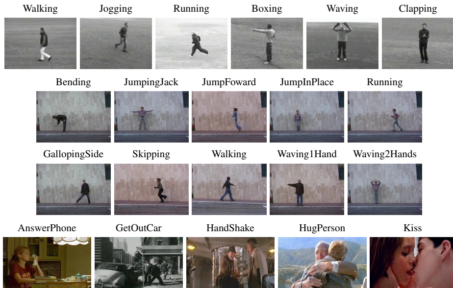
Figure 2: Sample frames from video sequences of KTH (top), Weizmann (middle), and Hollywood (bottom) human action datasets.

The Hollywood actions dataset [10] contains eight different action classes: answering the phone, getting out of the car, hand shaking, hugging, kissing, sitting down, sitting up, and standing up (see fig. 2, bottom). These actions have been collected semi-automatically from 32 different Hollywood movies. The full dataset contains 663 video samples. It is divided into a clean training set (219 sequences) and a clean test set (211 sequences), with training and test sequences obtained from different movies. In this work, we do not consider the additional noisy dataset (233 sequences).